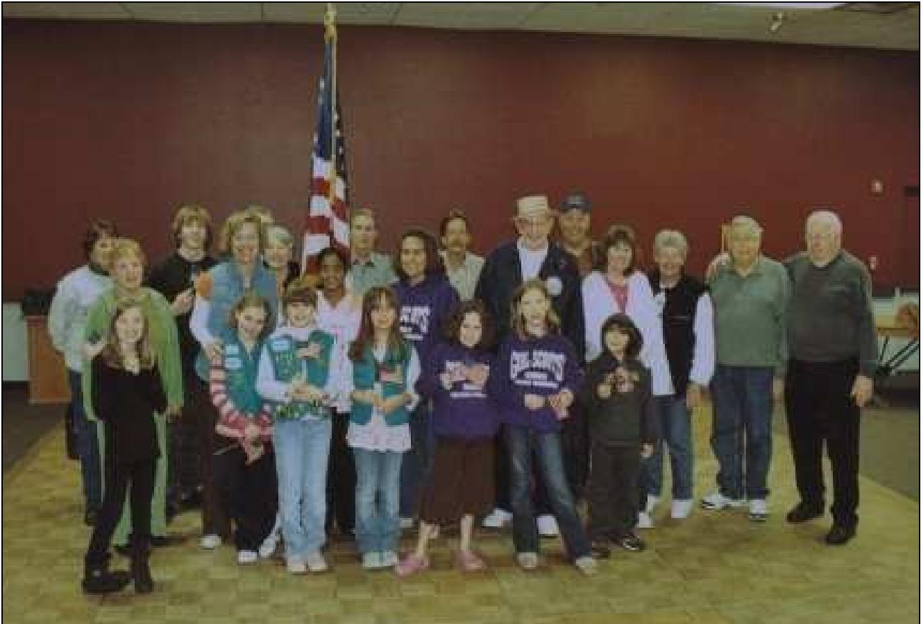
Members of the Boy Scouts, Girl Scouts and American Heritage Girls along with our own Troop Support members pause for a picture after assembling and packaging boxes for our troops overseas.